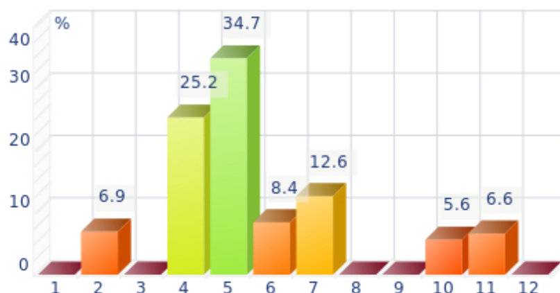
Your Dominant Houses

We are describing here the meaning of your dominant Houses, except the 6th and 10th Houses, already analysed in this Report, and the 1st House, which is not related to any concrete life area and therefore can provide no information here.